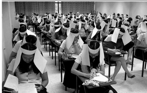
In an effort to curb rampant cheating, Bangkok's Kasetsart University created an anti-deceit paper helmet for students to wear during their midterm exams.

University students 'made to wear anti-cheating helmets' Students in Thailand appear to have been forced to wear helmets to prevent them from cheating during exams.